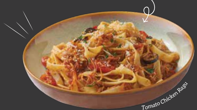
Tomato Chicken Ragu