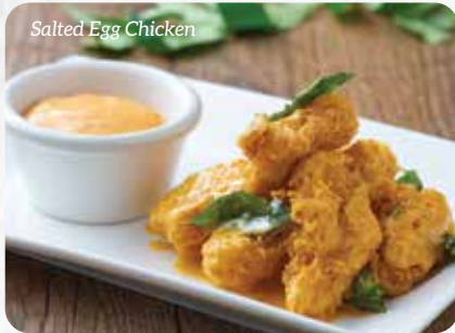
Salted Egg Chicken