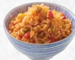
SPICY MEXICAN RICE