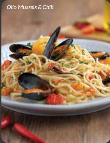
Olio Mussels & Chili

TOMATO CHICKEN RAGU 19.9 Chunky tomato sauce with roast chicken & mushrooms