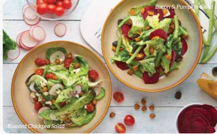
Roasted Chickpea Salad