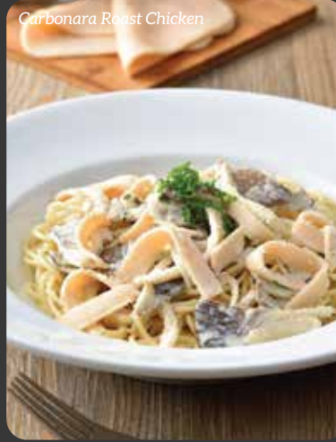
Carbonara Roast Chicken

OLIO MUSSELS & CHILI 18.9 Cherry tomato, mussels & chili tossed in extra virgin olive oil