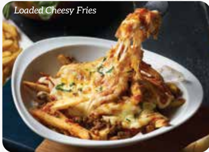
Loaded Cheesy Fries

Fries loaded with our in-house beef bolognese sauce, cheese & gravy