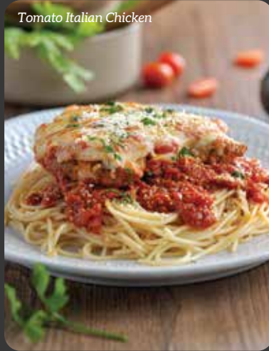
Tomato Italian Chicken